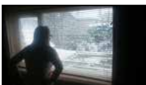
The morning before exam start. The level of disbelief is at a 100%