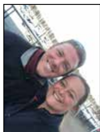
A very exhausted but happy couple, moments after the verdict: "We passed!"