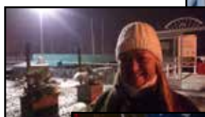
And it just kept on coming! After meeting the rest of the crew at the office, the boat was completely covered in snow. Luckily we have some hard core sleeping bags to keep us warm!