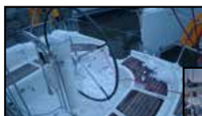
You must be a complete nutter to go sailing in this...