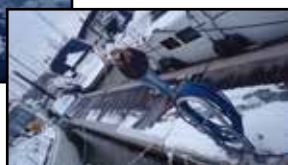
Mind your step on the pontoon!