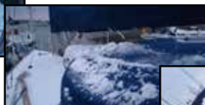
Re-frozen slush (i.e. ice) on the sprayhood